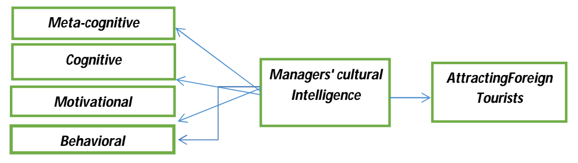
Figure 1: Conceptual model of the study

According to theoretical concepts, the conceptual model is depicted below. The research hypotheses were proposed based on it.