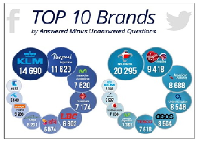
Figure 2: Top 10 Brands on Facebook and Twitter (with KLM on top)