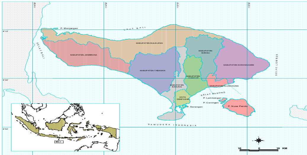
Figure 1 Geographic Location Map of the Bali Province

The Bali region is administratively divided into eight regencies and one city, 57 Districts, 716 Villages / Sub-districts, 1,488 ‘Pekraman’ Villages, and 3,625 ‘Banjar Pekraman’ (Bali Provincial Government, 2018). Regencies and cities in Bali consist of Jembrana, Tabanan, Badung, Gianyar, Karangasem, Klungkung, Bangli, Buleleng, and Denpasar City which are also the capital of the province of Bali. Besides Bali Island, Bali also consists of other small islands, namely Nusa Penida Island, Nusa Lembongan, and Nusa Ceningan which are the regions of Klungkung Regency. Serangan Island is located in the Denpasar City area, and Menjangan Island in Buleleng Regency, as shown in Figure 1.